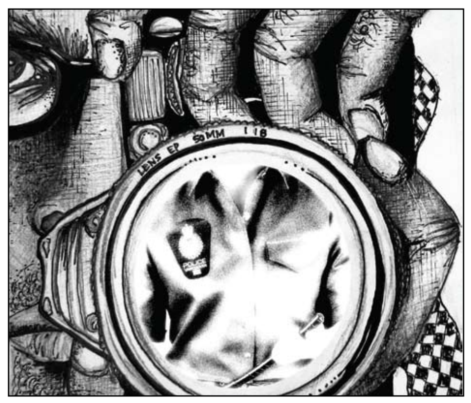
ILLUSTRATION BY REANNAN TYSON

"...and a 110 pound trophy wife, Hiroshi and I figured it was high time the rats that were stinking up this place were forced out for air."