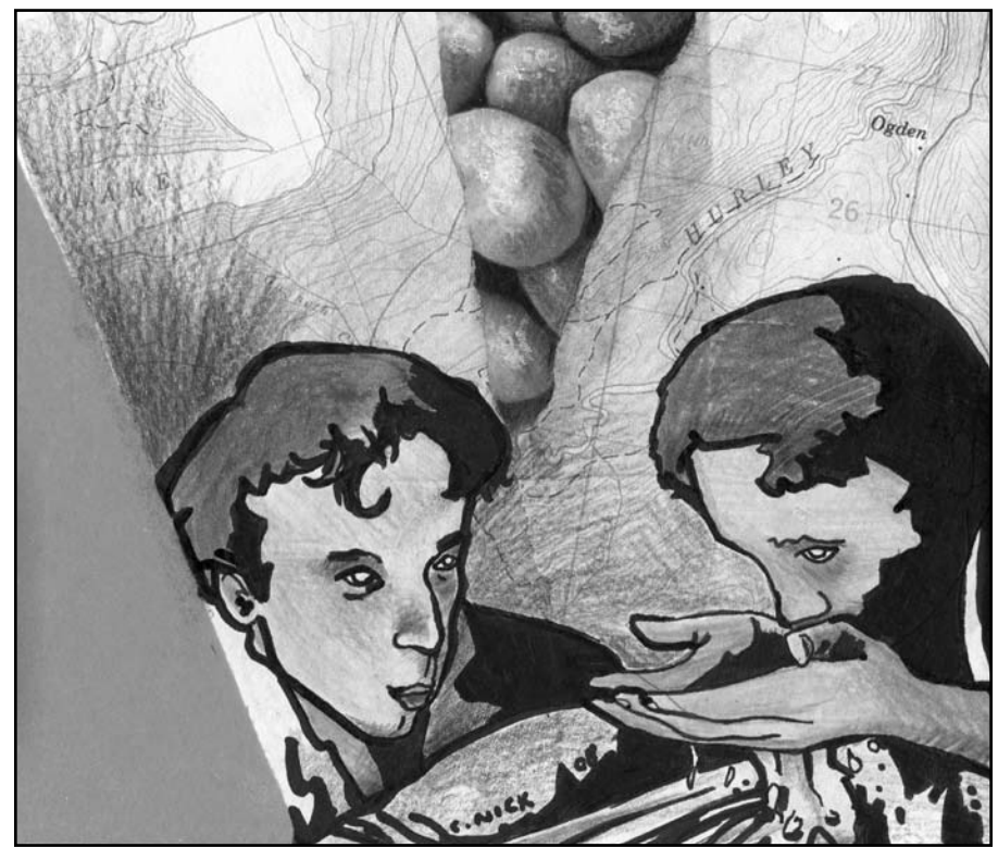
ILLUSTRATION BY CHRISTINA NICK

"Pal, I'm with you. But don't count on me farmin'... I've got a gold medal exit strategy that's gonna look after me and you both," Chuck smirks and pins the truck, rocks and straw spraying the old, red church on the corner.